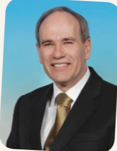
Tai NICHOLAS Chairman of The Pacific Youth and Sports Conference OFC General Secretary

Our young people need to know they can make a valuable contribution not only to their communities but also to our country.